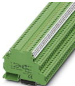
Power solid-state relay terminal block, input: 5 V DC, output: 3 - 30 V DC/3 A, terminal block width: 6.2 mm

Please be informed that the data shown in this PDF Document is generated from our Online Catalog. Please find the complete data in the user's documentation. Our General Terms of Use for Downloads are valid ( http://phoenixcontact.com/download )