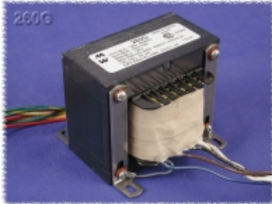
Plate & Filament 260 Series Universal Primary & 50/60 Hz. Operation