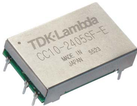
Manufactured by TDK

TDK-Lambda is a collaborative product brand between TDK and the Lambda group.