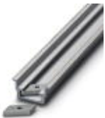
DIN rail, deep drawn, high profile, unperforated, 1.5 mm thick, material: aluminum, height 15 mm, width 35 mm, length 2000 mm

DIN rail, unperforated - NS 35/15 AL UNPERF 2000MM - 1201756