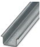
DIN rail, material: Galvanized, unperforated, height 15 mm, width 35 mm, length: 2 m

DIN rail, unperforated - NS 35/15 ZN UNPERF 2000MM - 1206586