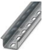
DIN rail, material: Galvanized, perforated, height 15 mm, width 35 mm, length: 2 m

DIN rail perforated - NS 35/15 ZN PERF 2000MM - 1206599