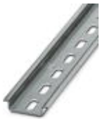
DIN rail, material: Galvanized, perforated, height 7.5 mm, width 35 mm, length: 2 m

DIN rail perforated - NS 35/ 7,5 ZN PERF 2000MM - 1206421