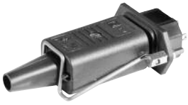
Cord retaining kits