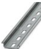
DIN rail, material: Galvanized, perforated, height 7.5 mm, width 35 mm, length: 2 m

DIN rail perforated - NS 35/ 7,5 ZN PERF 2000MM - 1206421