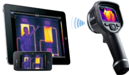
Wireless Connectivity to Smartphones, Tablets and more.