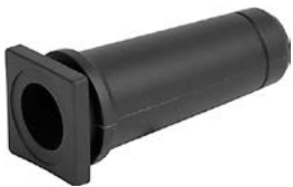
Cable Guard KT14 PVC Cable Guard for rewireable connectors