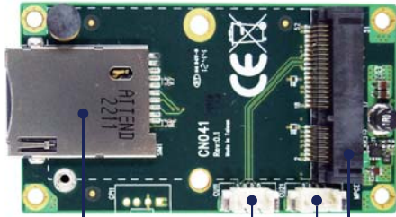
SIM Card Slot (Push-Push) (CU11~CU21) USB 2.0 PIN Header Mini PCIe Full-Size (USB only)