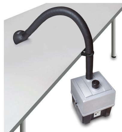
> Zero Smog EL unit