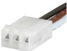
Wire Harness Wire harness for SCHURTER products