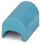
Replacement receptacle tray for CF-CRIMPHANDY

Cutting tool - CF CRIMPHANDY CUTTER - 1212520