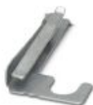
Waste guide plate 2, for CF CRIMPHANDY 1,5

Replacement part - CF CRIMPHANDY 1,5/GP2 - 1212844