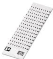
Marker card, self-adhesive, horizontally labeled with the consecutive numbers: 1 ... 10, 10-section marker strips with 12 identical decades, white

Please be informed that the data shown in this PDF Document is generated from our Online Catalog. Please find the complete data in the user's documentation. Our General Terms of Use for Downloads are valid ( http://phoenixcontact.com/download )