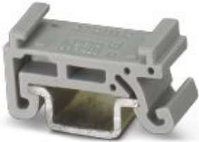
DIN rail adapter, width: 8 mm

Please be informed that the data shown in this PDF Document is generated from our Online Catalog. Please find the complete data in the user's documentation. Our General Terms of Use for Downloads are valid ( http://phoenixcontact.com/download )